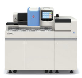
AIA-900 with 9 tray sorter 90 Tests Per Hour Also available with 19 tray sorter