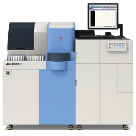
AIA-2000 200 Tests Per Hour